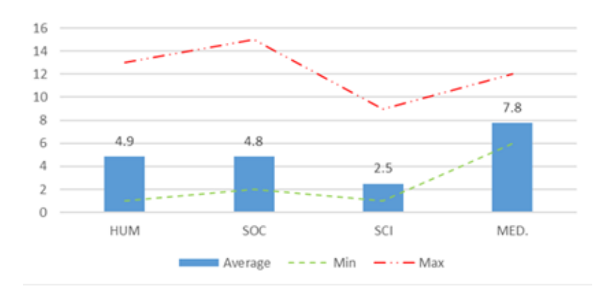
Fig. 2. The average, minimum and maximum number of faculties that employ core faculty members in the fields of the humanities, social sciences, sciences and medical areas at CUNI.

The above approximation measure does not allow us to fully appreciate the phenomenon of fragmentation, however. For example, although core faculty members in Law, Mathematics, Anthropology, or Geological and Environmental Sciences are affiliated at 5 units or more, more than 80% (99% in the case of Law) of core faculty members work at a single unit. In such cases, it is perhaps more appropriate to speak of "splintering" rather than fragmentation proper.